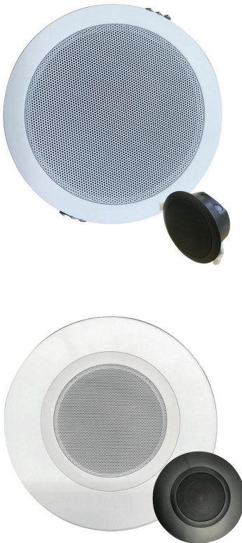
L - VCP06D - Recessed Ceiling Loudspeaker & L - SMB - Surface mount mounting box